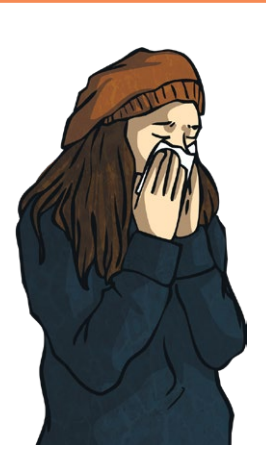
Ash can cause health problems for people and animals.

People can be swept away by pyroclastic flows or lahars (mudflows).