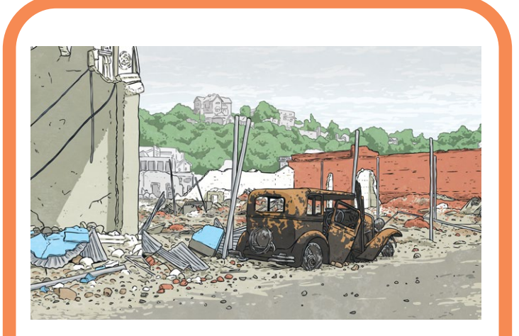
Frequent earthquakes can damage property.