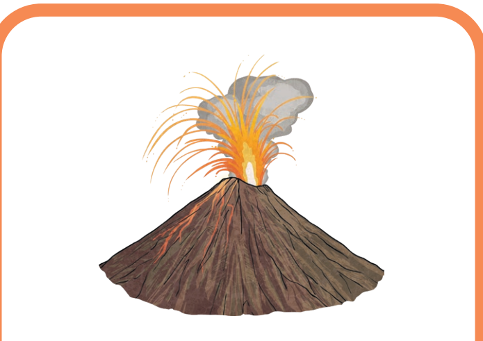
Scientists can predict when a volcano will erupt.

Buildings can be destroyed by lava flow.